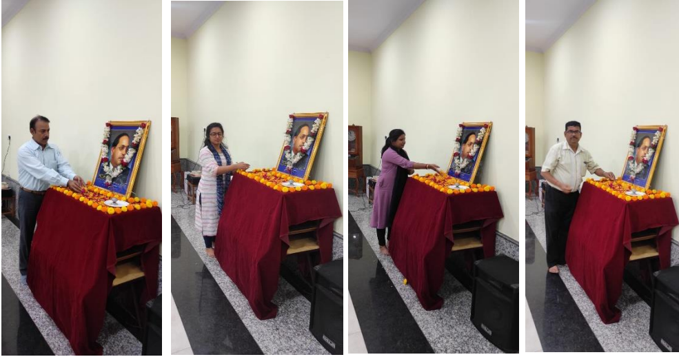
[Photos of Officer's and staff's of KGPW paid tribute to him by offering flowers on the portrait of Dr. B R Ambedkar]

Celebration of Ambedkar Jayanti : Ambedkar Jayanti is celebrated on April 14th to mark the birth anniversary of the father of the Indian Constitution, Dr Bhimrao Ramji Ambedkar.