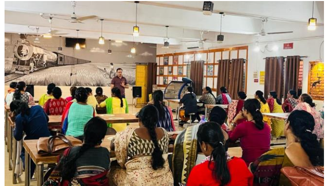
[Photos of Health Awareness seminar for Women Employees on 10.04.2023 held at WS Main Canteen]