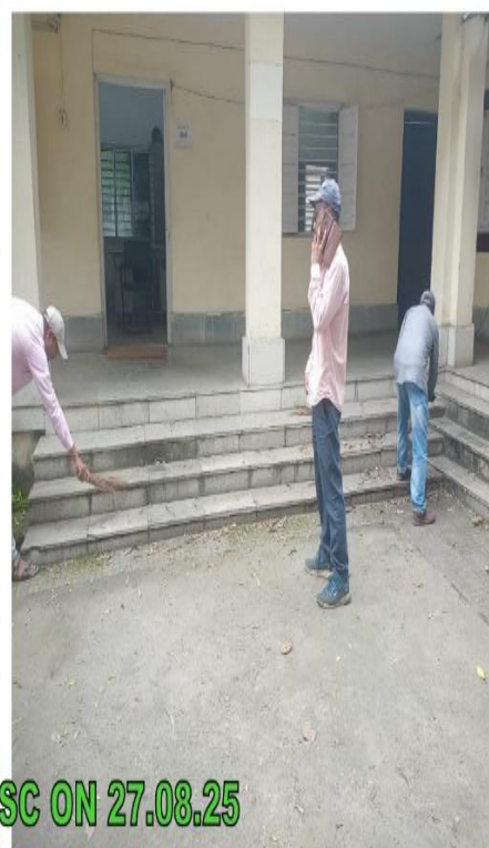
OFFICE PREMISES CLEANING AT SSE/WORKS/BKSC ON 27.08.25