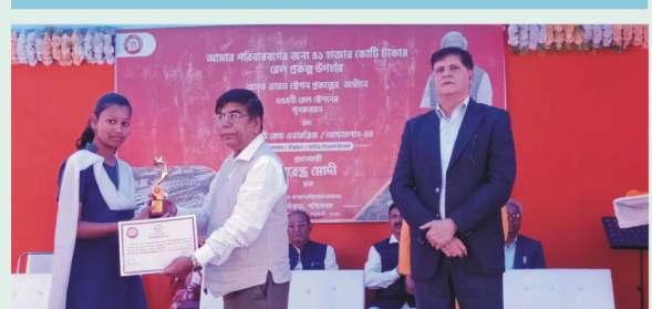
Dr. Subhas Sarkar, Hon'ble Union Minister of State for Education distributing awards among school students at Bankura station of Adra Division on 26.02.2024.