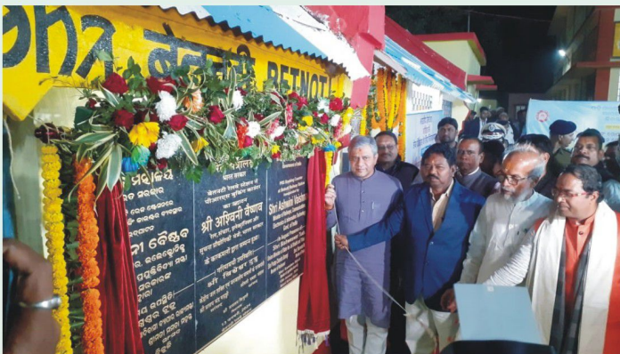
Shri Ashwini Vaishnaw, Hon'ble Minister of Railways addressing the gathering at Gopinathpur Nilgiri Railway station of Odisha on 13.01.2024