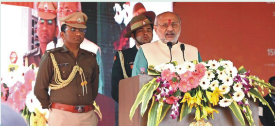
Shri C. P. Radhakrishnan, Hon'ble Governor of Jharkhand addressing the gathering at Tatanagar station of Chakradharpur Division on 26.02.2024

Foundation Stone was laid for 6 Amrit stations of Odisha at a total estimated cost of Rs. 240.82 Crores. The 6 stations of Odisha to be redeveloped under the Amrit Station Scheme are, Bimalgarh, Jaroli, Rairangpur, Panposh, Baleshwar and Betnoti. Moreover, the total estimated cost for 23 Road Overbridges/Underpasses in Odisha is Rs. 192.41 Crores.