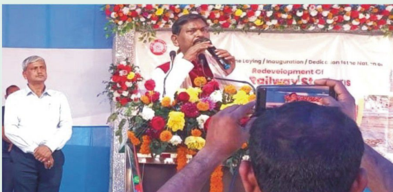
Shri Arjun Munda, Hon'ble Union Minister of Tribal Affairs and Ministry of Agriculture & Farmer's Welfare addressing the gathering on 26.02.2024. He attended the functions at Sini and at Road Overbridge-160 near Mahalimarup of Chakradharpur Division.