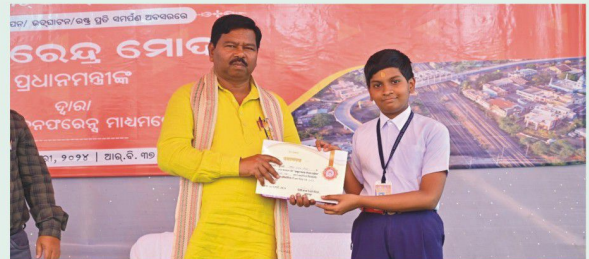
Shri Bishweswar Tudu, Hon'ble Union Minister of State for Jalshakti and Tribal affairs distributing awards among school students at Level Crossing 37 of Kharagpur Division on 26.02.2024.