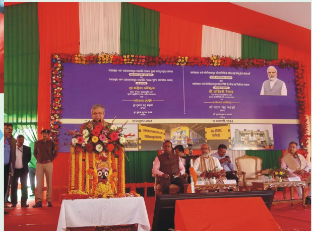
Shri Ashwini Vaishnaw, Hon'ble Minister of Railways flagging off Gopinathpur Nilgiri - Balasore new MEMU train service from Gopinathpur Nilgiri Railway station of Odisha on 13.01.2024