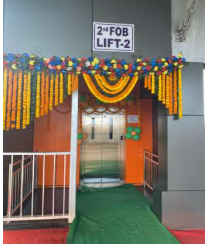
Lifts Commissioned at Railway Stations