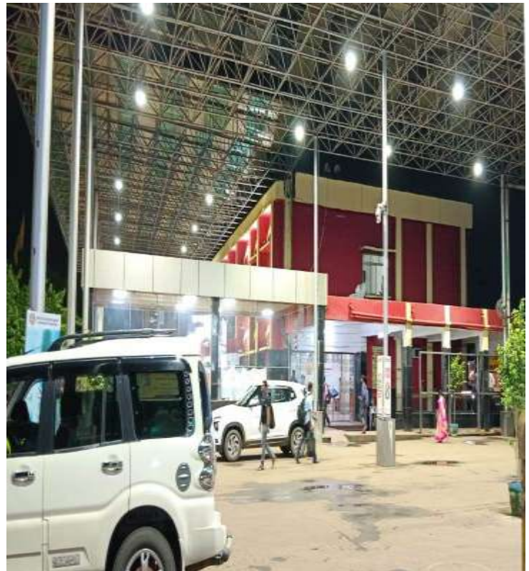
Illumination of Station and Circulating Area