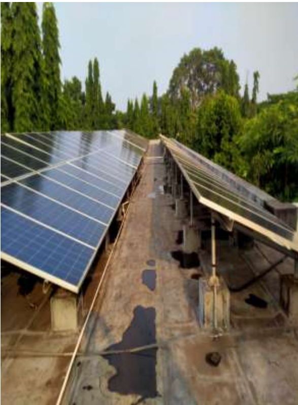
Rooftop Solar Plant