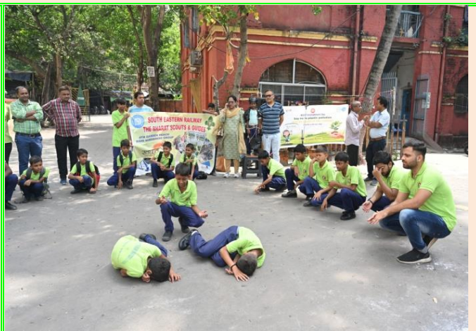
Performance by Bharat Scouts & Guides at BNR Colony