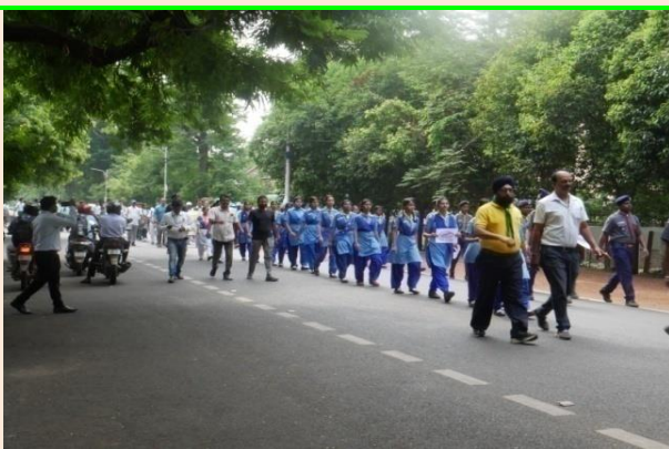
Prabhat Ferry organized at KGP Division for awareness of single use plastic