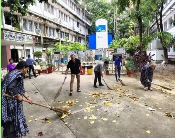
Officers & staffs of Medical Department participated in shram-daam at Cenytral Hospital at GRC

Awareness campaigns were conducted in the railway colonies, hospitals for hygiene and reduce use of single use plastic. Training imparted on the residents, shop owners, employees on sustainable practices, monitoring and strengthening waste management practices. Use of eco friendly materials were encouraged. Drawing, essay, quiz competitions were organized during this period as part of awareness programme.