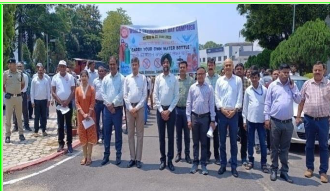
DRM/ RNC & all BOs participated in walkathon for awareness on reducing use of plastic