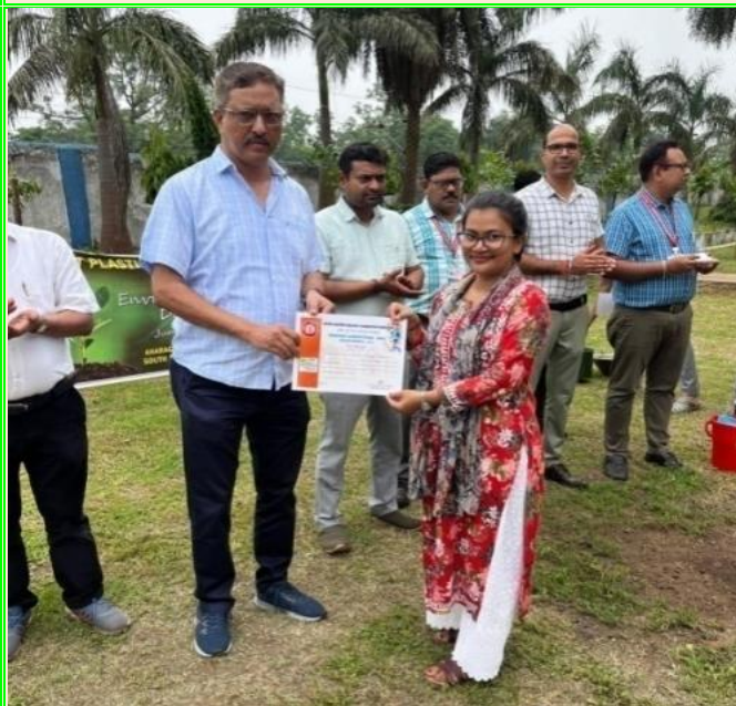
Staffs were facilitated for their outstanding contribution during the WED campaign 2025