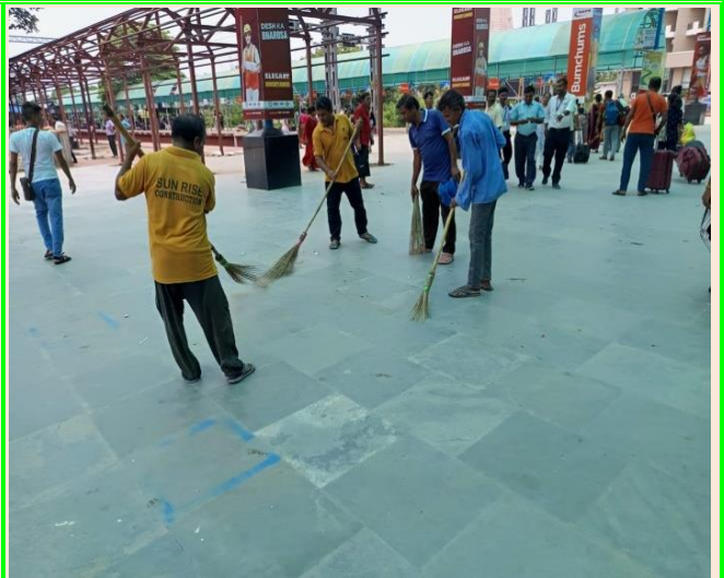
Cleaning Campaign at DIGHA Railway Station