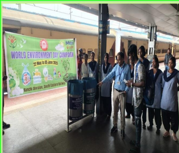
World Environment Day Campaign at Ranchi Division Emphasizes Plastic Reduction, Recycling, and Waste Management.