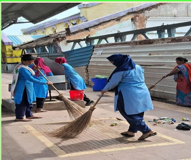
Cleaning campaign at MDN Railway Station