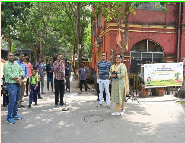
Awareness drive conducted at GRC colony and bazar on importance of reducing use of single use plastic