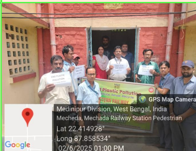
Awareness Campaign to End Plastic Pollution at Mecheda Station in KGP Division