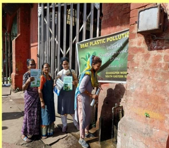
World Environment Day Campaign conducted at Kharagpur Workshop, focusing on Single Use Plastic Reduction, Inspection of water refill points and encourage staff refill their own bottles.