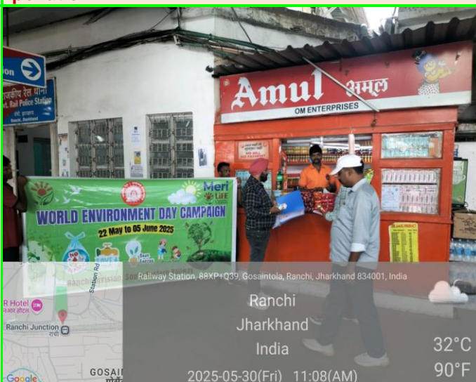
World Environment Day Campaign at RNC division sensitized vendors and staff on partial cutting of dairy packaging to curb microplastic pollution.