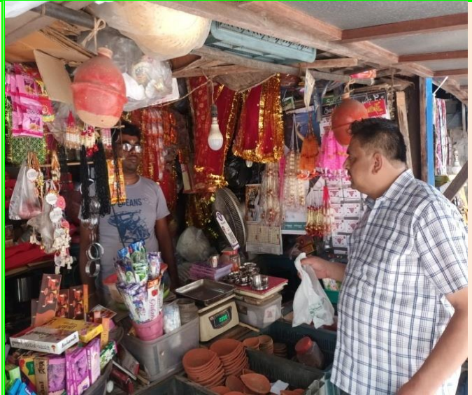
Vendors at SER HQ Colony is encouraged to use bio degradable plastic