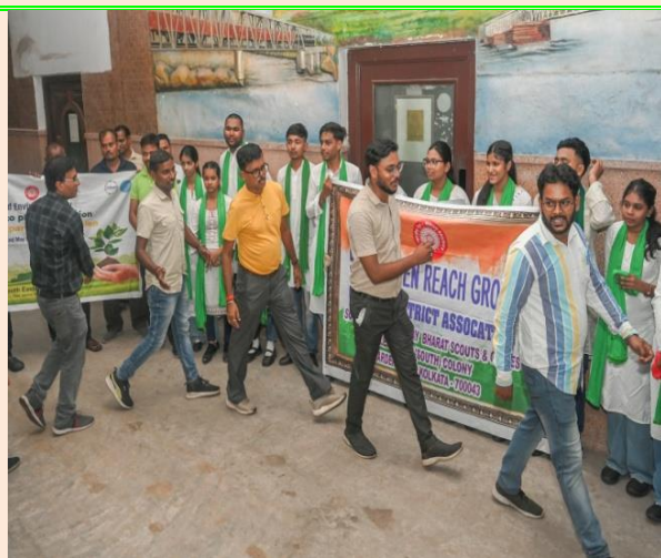
Awareness programme organized by Medical Department at GRC on the importance of reducing use of single use plastic