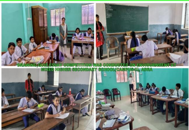
DRAWING, QUIZ, ESSAY COMPETITION WAS CONDUCTED ON ENVIRONMENT AT MIXED HIGHER SECONDARY SCHOOL (CAMPUS-II), ADRA