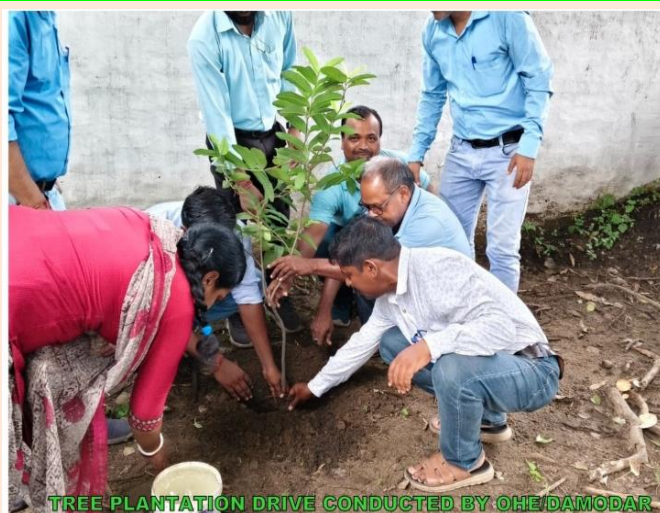
Tree plantation drive at OHE/ Damodar at ADRA Division