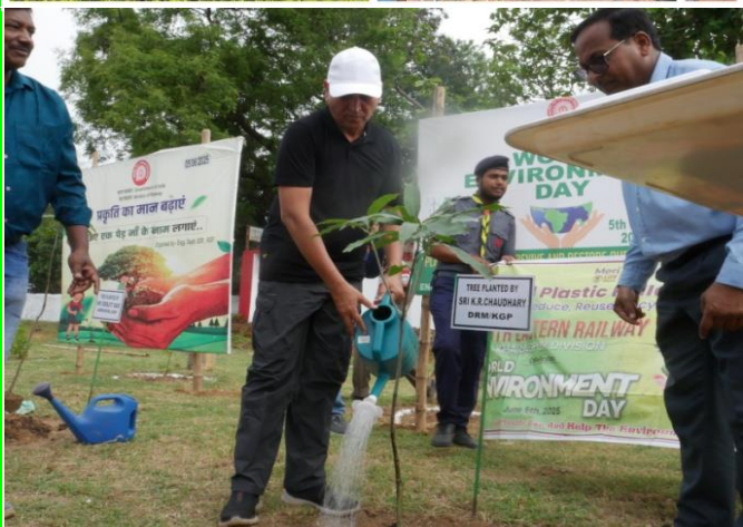
DRM/ KGP participating in the tree plantation programme organized at KGP Division