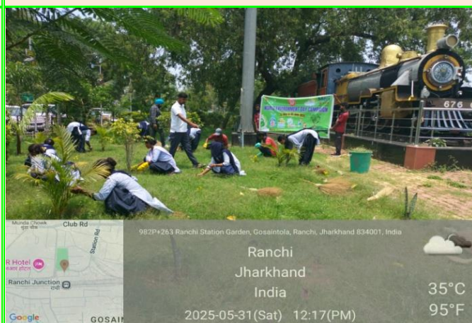
Cleanliness Drive was organized at Ranchi railway premises as part of the World Environment Day campaign to raise awareness about reducing and curbing micro plastic pollution