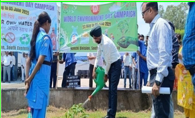
DRM/ RNC participating in the tree plantation programme organized at KGP Division