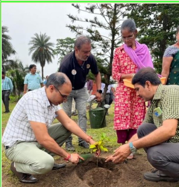
KGPW Officers and staffs participated in tree plantation programme