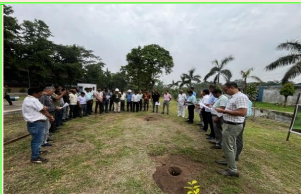
Officers & staffs at KGPW during Mission LIFE pledge