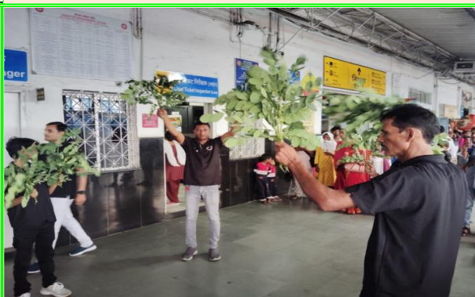
Nukkad natak was organized at Hatia station as part of the World Environment Day campaign to raise awareness about reducing and curbing microplastic pollution