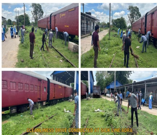
Cleanliness Dtive at Sick Line ADRA