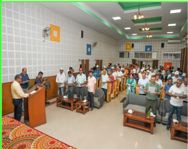
GM/ SER administering the Mission LIFE pledge to all Officers and staffs at GRC