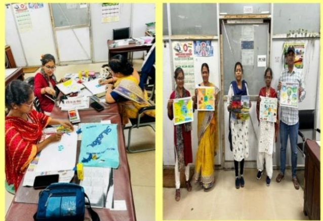
A drawing competition on sustainable environment has been conducted at Kharagpur Workshop.