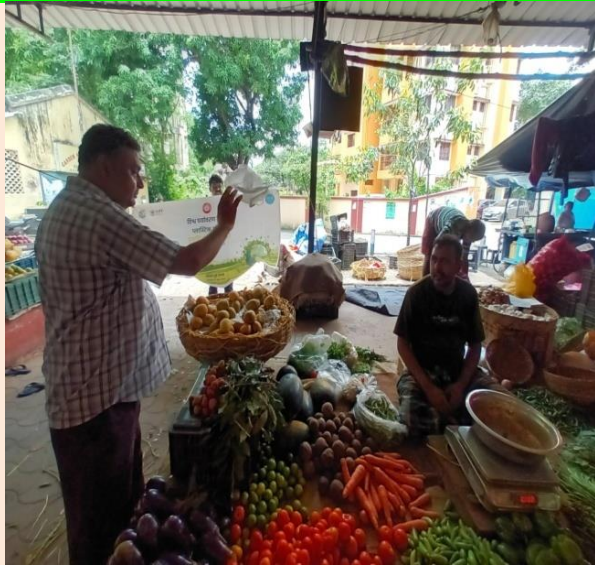
Vendors at SER HQ Colony is briefed about menace of single use plastic and benefit of bio degradable plastic

As part of World Environment Day Campaign 2025, at SER HQ and Divisions, staffs, passengers, vendors were sensitized on proper waste segregation practices, knowledge imparted for benefits of reduced use of single use plastic. During the campaign awareness campaigns were organized at stations & colonies for proper waste segregation.