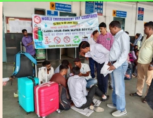
An awareness drive was conducted at Hatia Station to encourage the use of cloth/jute bags