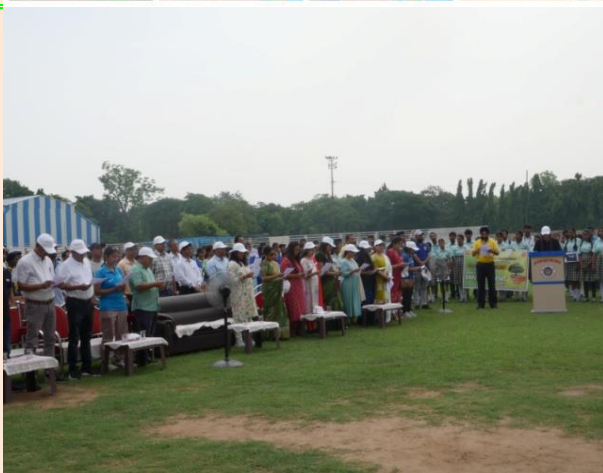
DRM/ KGP/ SER administering the Mission LIFE pledge to all Officers and staffs at GRC