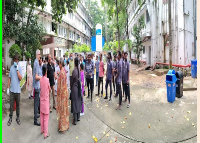
Open Air awareness program organized at Central hospital for employees