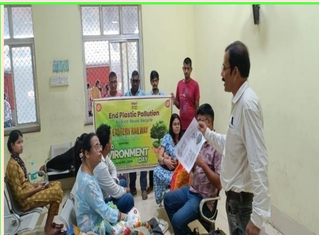
Passengers are getting apprised at SHM station on the menace of single use plastic