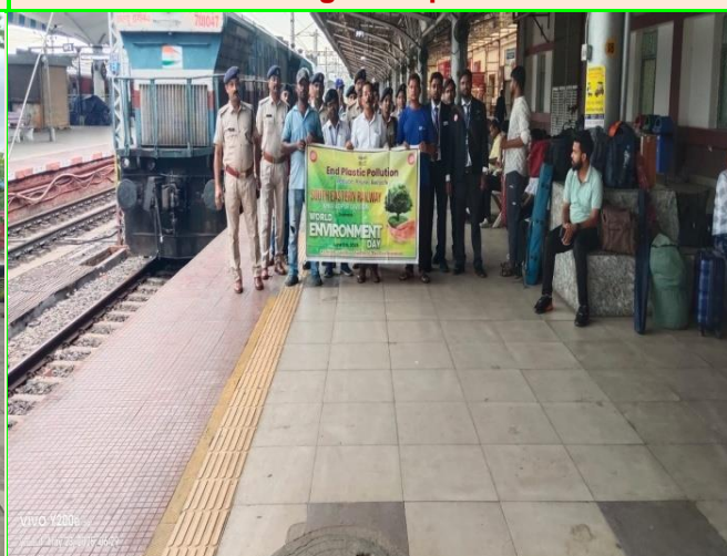
Awareness Campaign held at SHM & KGP Station in KGP Division