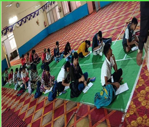
Drawing & essay competitions on a sustainable environment were conducted as part of the World Environment Day campaign