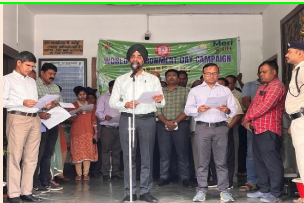
DRM/ RNC/ SER administering the Mission LIFE pledge to all Officers and staffs