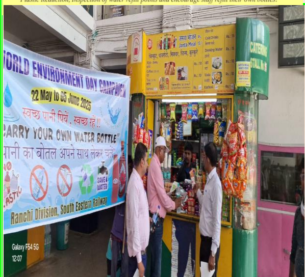
World Environment Day Campaign at RNC division sensitized vendors and staff on partial cutting of dairy packaging to curb micro-plastic pollution