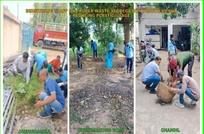
SENSITISING STAFF ON PROPER WASTE SEGREGATION PRACTICES AND REDUCING PLASTIC USAGE