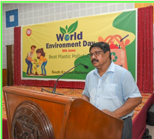
PCME/ SER addressing the crowd on the importance of sustainable development practices adhered by SER

A Nukkad Natak staged by members of S E Railway Bharat Scouts & Guides to create awareness on Beat Plastic Pollution at BNR Officers' Club on 05.06.2025