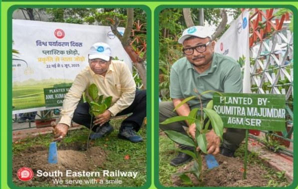
GM and AGM of SER planting saplings as a part of observance of World Environment Day at SER Headquarters, Garden Reach on 05.06.2025

https://www.facebook.com/southeasternrailwaykol https://www.instagram.com/serailwaykolkata/ https://x.com/serailwaykol https://www.youtube.com/@southeasternrailway1256