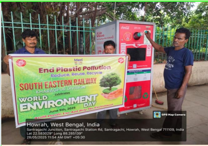
Plastic Bottle Crushing Machines' operation is checked and demo given to passengers for proper use