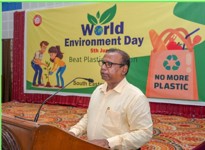
GM/ SER addressing the crowd on the importance of reducing the use of single use plastic