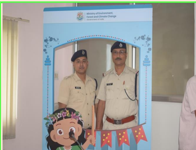
Selfie Booth for awareness on Mission LIFE and WED Campaign 2025