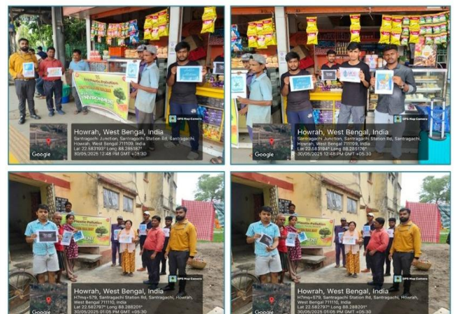
World Environment Day awareness Campaign conducted at various places of KGP Division focusing on reduce plastic pollution