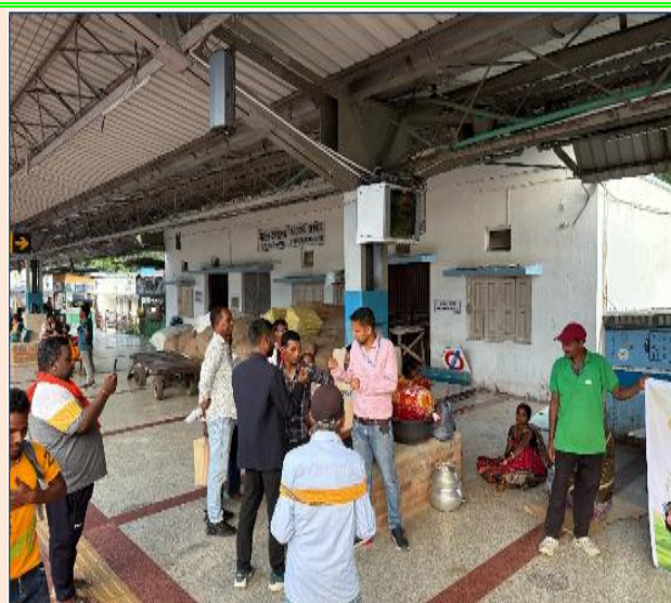
Awareness Campaign held at CKP Station in CKP Division