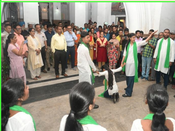
Performance by Bharat Scouts & Guides at GM Office, GRC

Nukkad Nataks were staged by members of South Eastern Railway's Bharat Scouts & Guides, all across the zone to create environmental awareness and benefits of reduced plastic use for our present and future generation