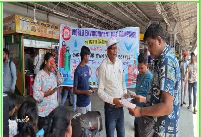
Awareness drive was conducted at the RNC division on World Environment Day campaign