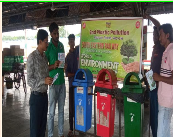
Passengers are apprised on proper waste segregation & disposal at KGP Division