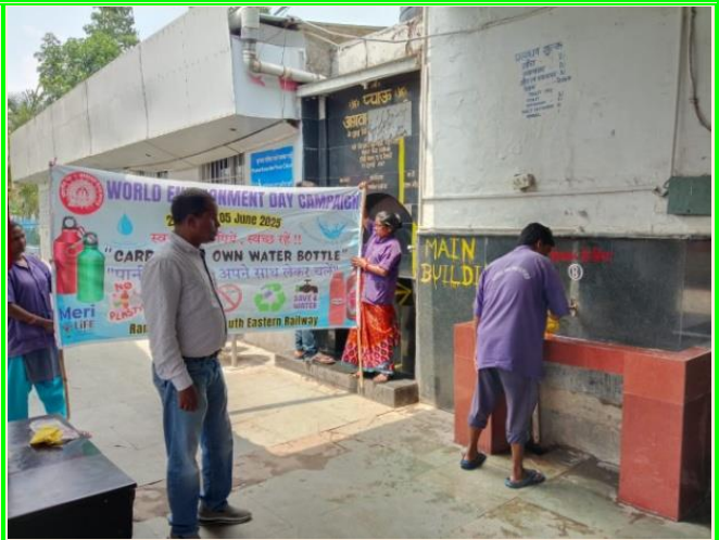
A special drive was conducted at the RNC division on World Environment Day campaign to clean and revive water bodies near railway premises