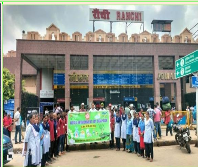
Awareness Campaign held at RNC Station in RNC Division