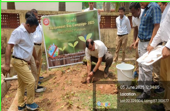
Pledge taking ceremony & Tree plantation drive at MDZTI/ KGP