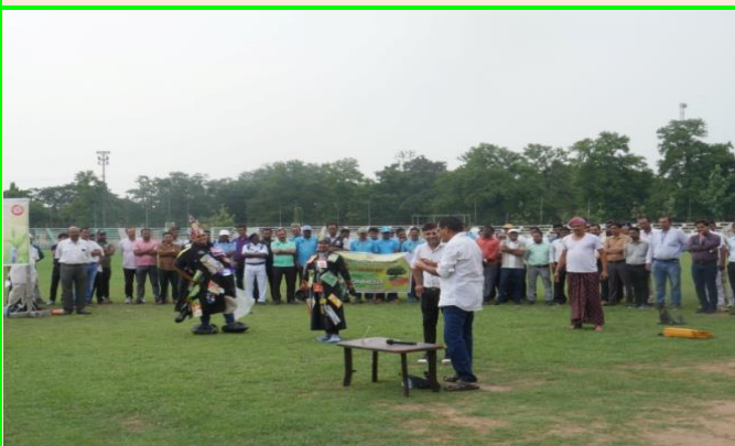
Nukkad Natak organized at SERSA, KGP