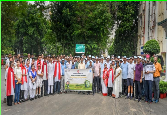
GM/ SER, AGM/ SER & all PHODs, HODs and staffs participated in an Awareness walkathon on the eve of World Environment Day 2025