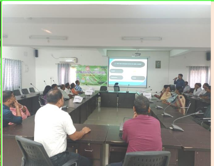
Quiz competition on a sustainable environment was conducted as part of the World Environment Day campaign