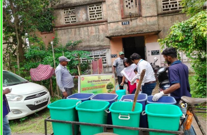
Railway Staffs at MCA Colony are briefed on proper segregation of waste