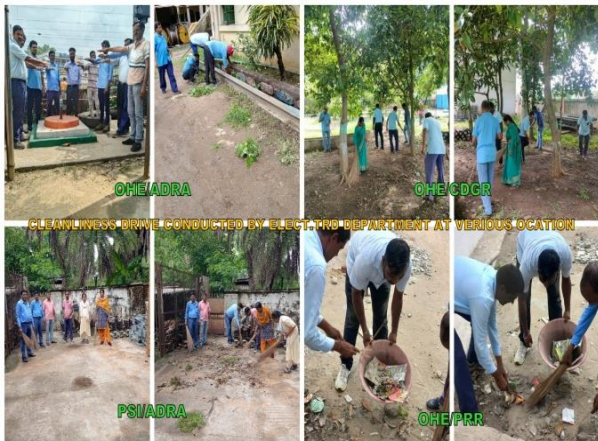
Proper waste segregation is practised at OHE ADRA & CDGR in ADRA Division