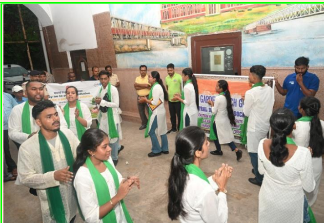
Awareness programme organized by Bharat Scouts & Guides