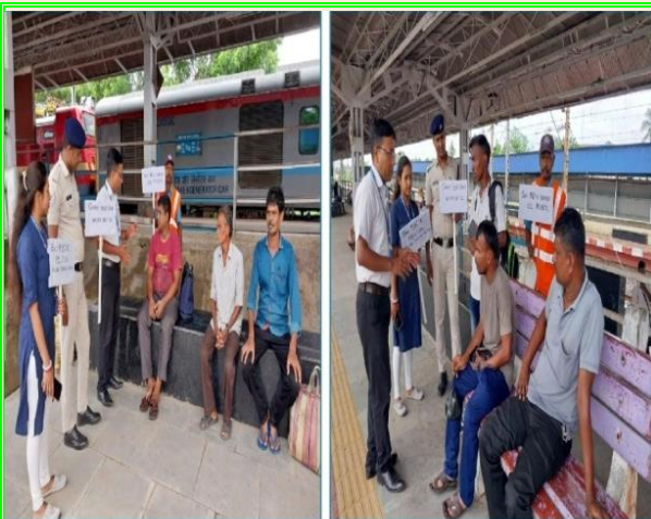
Under the aegis of observance of the 'World Environment Day Campaign 2025' over South Eastern Railway, A passenger awareness Program has been organized at DASNAGAR Station to aware passengers about the hazards of single use plastic and encouraging them to carry their own water bottles