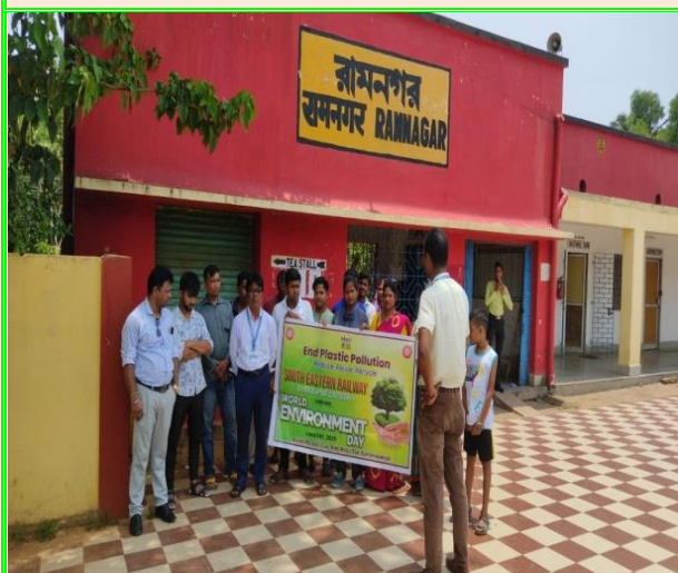
Awareness programme at RMRB Railway Station on End Plastic Pollution and Say No to Single –Use Plastic.