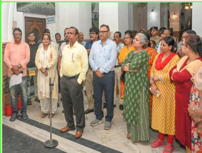
GM/ SER addressing the crowd on the menace of single use plastic