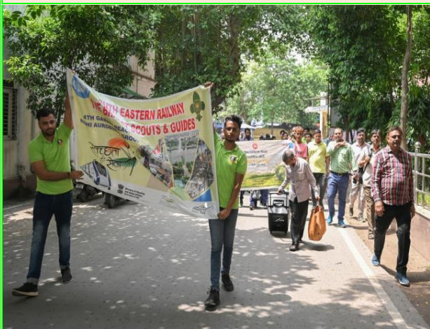
Rally organied at SER HQ colony on theme of # Beat Plastic Pollution