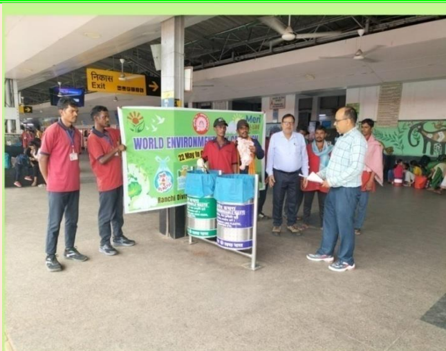
World Environment Day Campaign at Ranchi Division Emphasizes Plastic Reduction, Recycling, and Waste Management