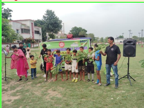
Nukkad natak was organized at Hatia railway colony as part of the World Environment Day campaign to raise awareness about reducing and curbing micro plastic pollution